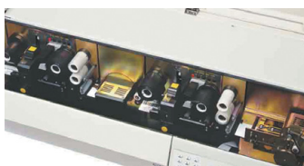
Two print modules